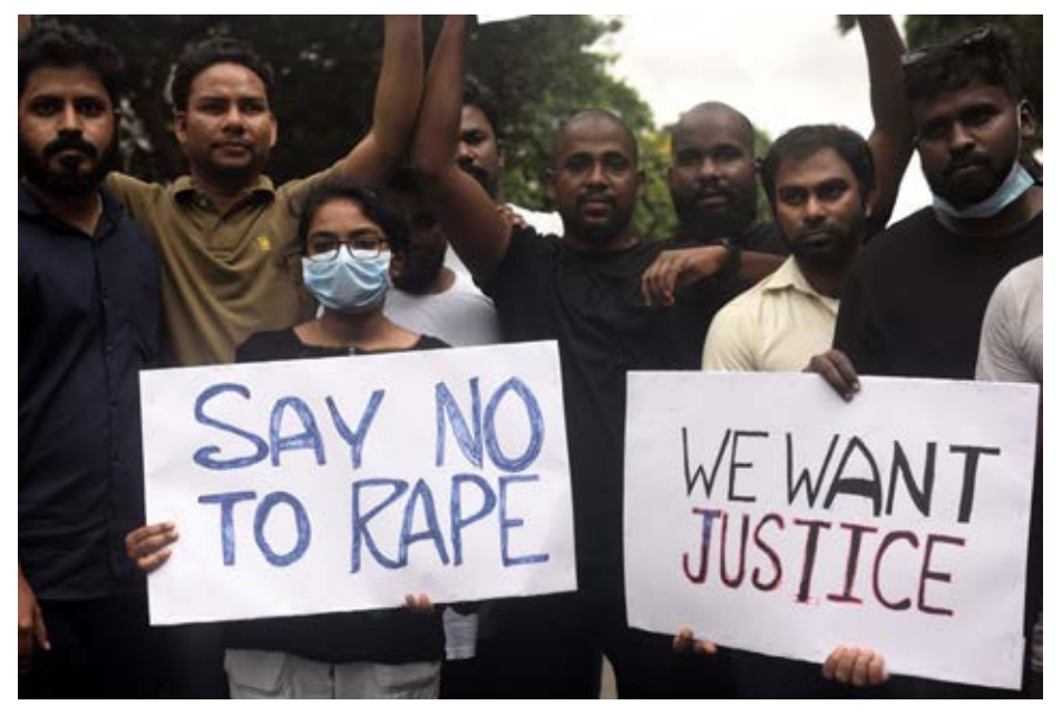
2022: Activists in Kolkata protest against the early release of men convicted of a brutal rape.

Originally, the film was supposed to be a portrayal of the women's rights activists