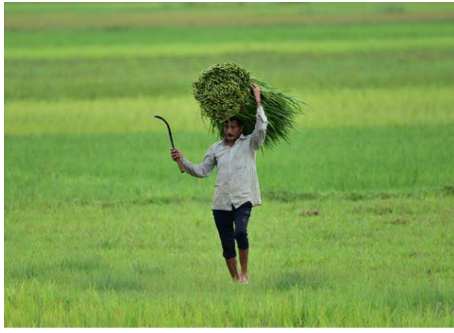
Our focus section on food security starts on page 20. It pertains to the UN's 2<sup>nd</sup> Sustainable Development Goal (SDG2): Zero hunger. It also has a bearing on other SDGs.