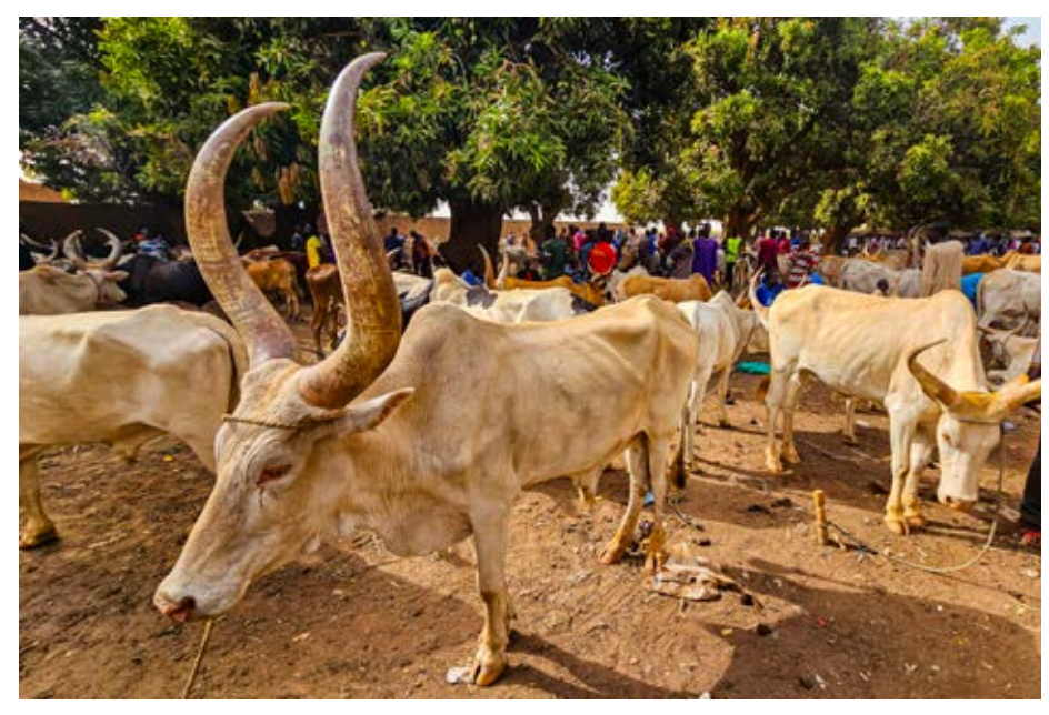
Cattle auction in South Sudan