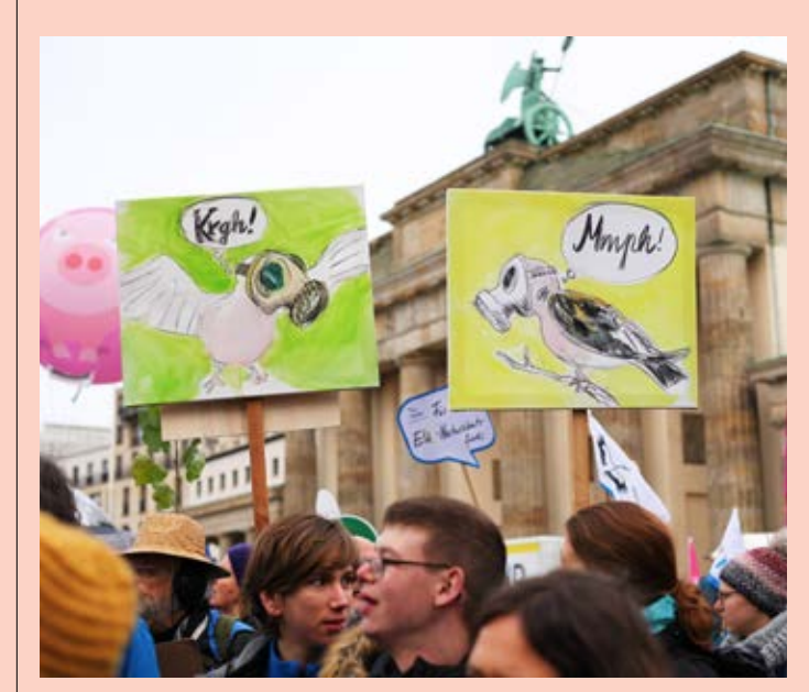
Anti-pesticide protest in Berlin in 2020.

management wanted to make Bayer a key player in agrochemical industries. They achieved that goal – but that success has since led to considerable headaches. Especially the lawsuits in the USA have proven to be very costly. SN