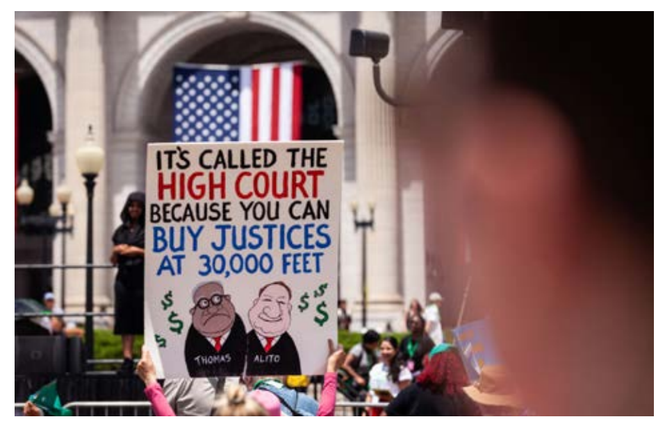
Justices of the Supreme Court have gone on luxury trips paid by plutocrats - protest in Washington.