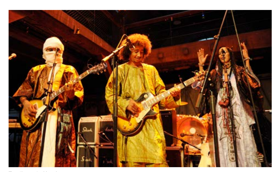
Tamikrest in Hamburg.