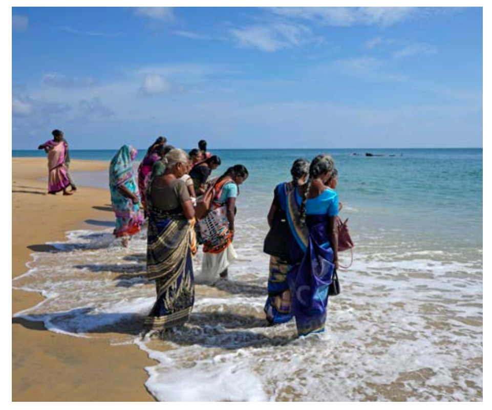
Ethnic Tamils commemorate family members killed in Sri Lanka's civil war.

The origins of these conflicts can be traced back to the 1950s. The then Prime Minister Solomon W. R. D. Bandaranaike introduced a law commonly referred to as the Sinhala Only Act. It replaced English with Sinhala as the only official language of the then Ceylon and excluded Tamil from the Act. This aided his political campaign which focused on the promotion of Sinhala Buddhist culture. The ideology of the "Sin-