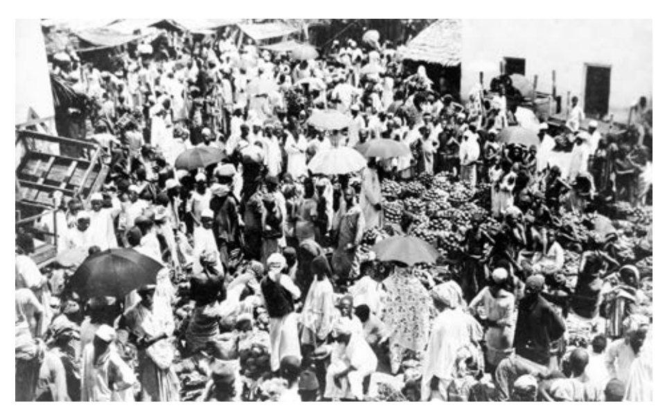
A market in Zanzibar at the beginning of the 20th century.