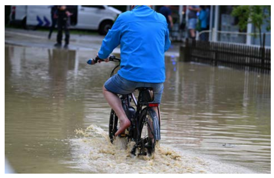
Flooding in the Lake Constance region: Germany experienced extreme weather again this year. Development policy comprises measures to fight the climate crisis globally.

3. Active migration management. Since 2015, these kinds of measures have led to development-policy changes. For example,