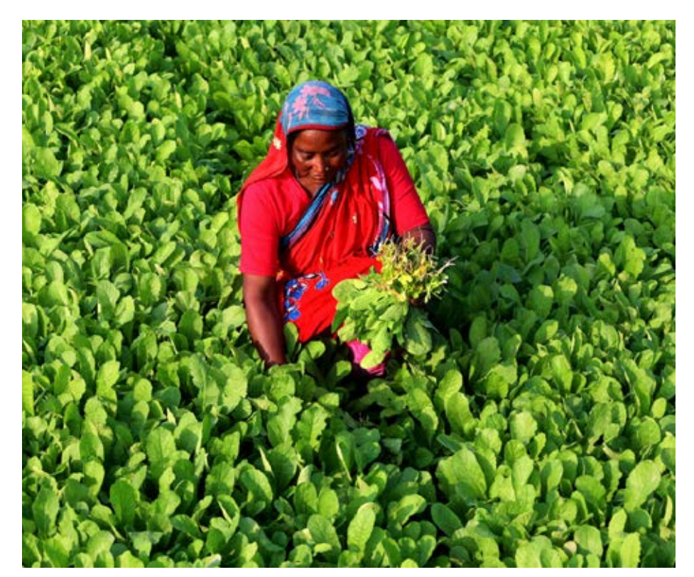
Growing vegetables in climate-resilient manner generates incomes in Bangladesh.