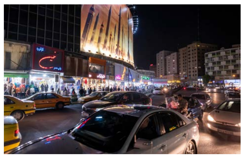
Militaristic propaganda of the Islamist government in Tehran.

Von Soest points out that those imposing sanctions must always consider the impacts of the coercive instruments they employ – both on the target country and at home. On the one hand, sanctions have a domestic political dimension, affecting both the national economy and the local population. This was made very clear by the discussions surrounding Germany's rapid phase-out of Russian oil and gas. On the other hand, sanctions can also prompt countermeasures. What is more, they rarely bring about an immediate change of course in the targeted country. So, they require