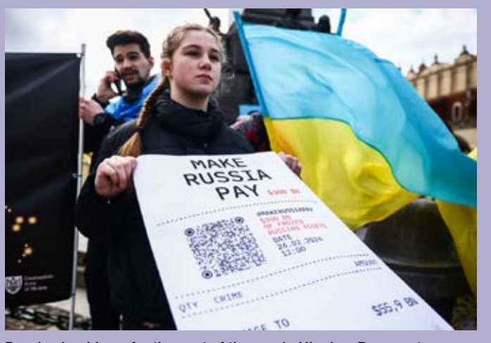
Russia should pay for the cost of the war in Ukraine. Banner at a Solidarity With Ukraine rally staged in February in Krakow, Poland.

Von Soest concludes that the massive sanctions imposed by the west did not persuade Russia to change course, but they do have a medium to longterm effect. They make access to the financial market more difficult, cause long-term damage to the Russian economy and thus curb the country's capacity to continue the war of aggression. The individual sanctions imposed also increase the pressure on the Russian regime. Overall, von Soest believes that the sanctioners have sent a globally visible signal for central standards of international law such as territorial integrity and state sovereignty. DW