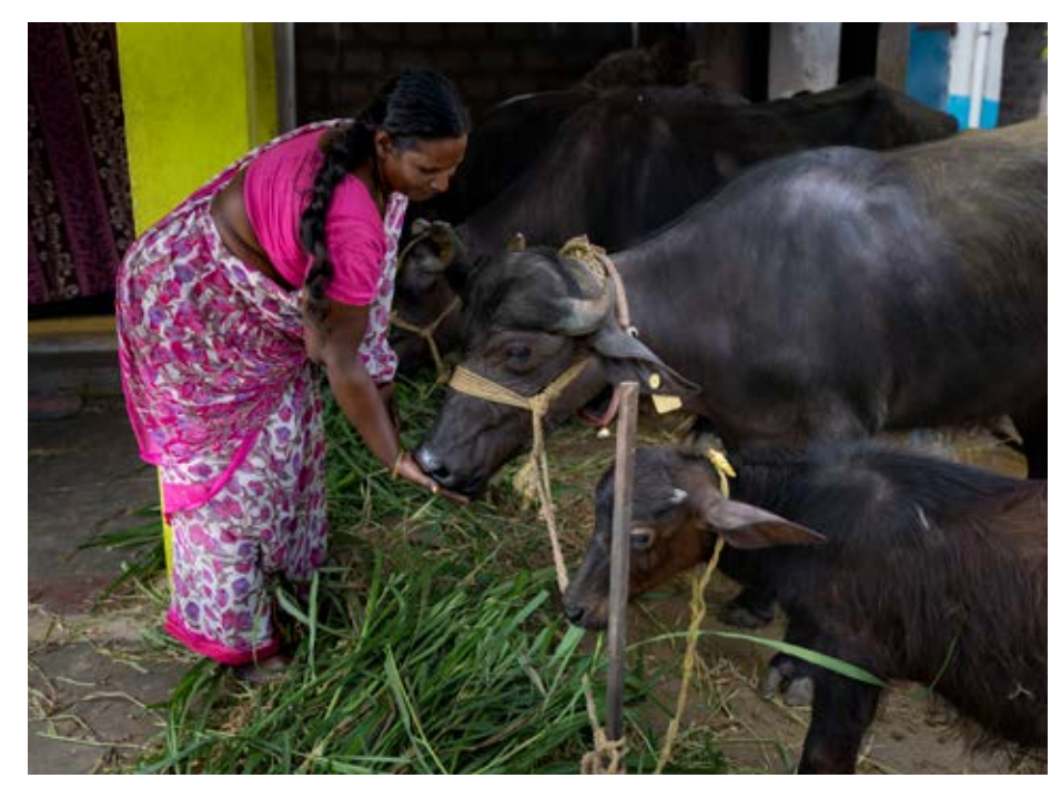
Buffaloes are relevant for natural farming in the South Indian state of Andhra Pradesh.

Yes, we do, but the trouble is that multinationals keep hijacking terms like this. They modify their destructive patterns slightly and then claim they are now regenerative.