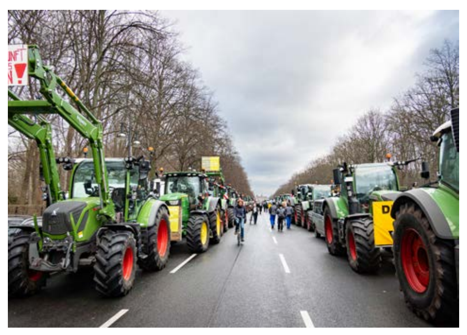
German farmers rallying with tractors in opposition to subsidy cuts in January 2024.

Yes, indeed. At the global level, meat production has become very destructive. It is a driver of deforestation. Huge holdings use antibiotics not to cure, but to prevent diseas-