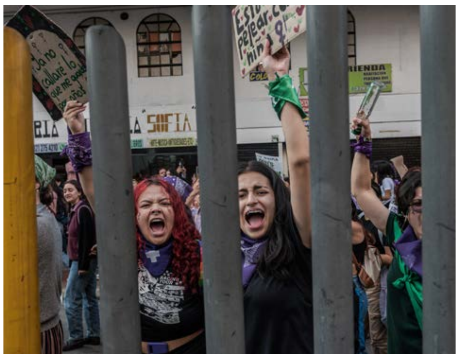
Protests for women's rights in Bogotá, Colombia, during the International Women's Day in March.

The Colombian society is characterised by an age-old machismo culture that oppresses women. Gender-based violence remains a daily scourge. The project Observatorio Feminicidios Colombia hosted by the civil-society organisation Red Feminista Antimilitarista counted a total of 525 femicides in 2023 in the country with a population of about 52 million. According to the civil-society organisation The Advocates for Human Rights, the National Institute of Legal Medicine and Forensic Sciences registered more than 47,700 cases of domestic vi-